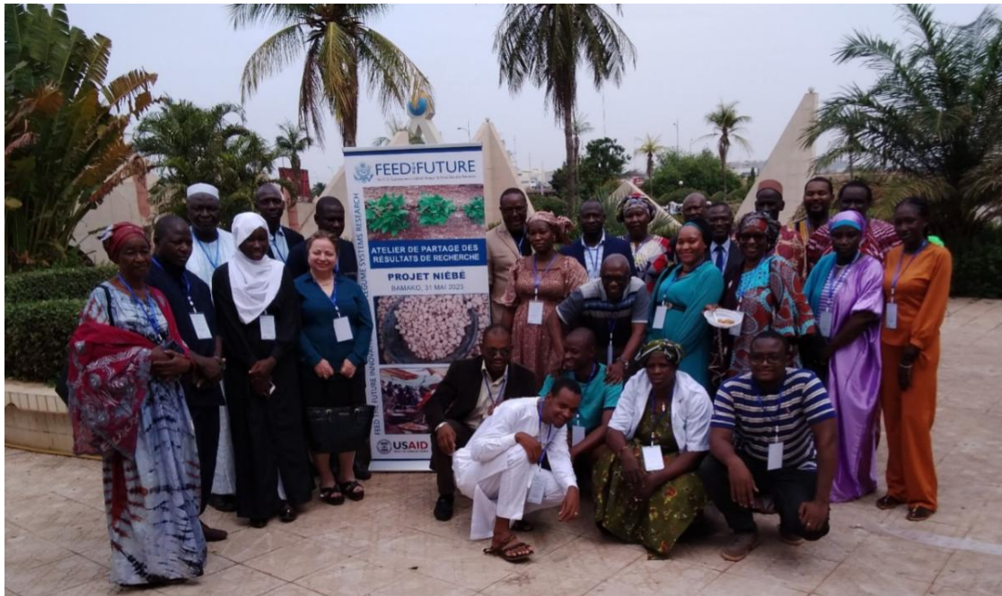
Participants of the Legume Systems Innovation Lab project, “Quantifying the Scale and Scope of Nutritious Cowpea Products in Local Markets of West Africa” dissemination workshop in Bamako, Mali